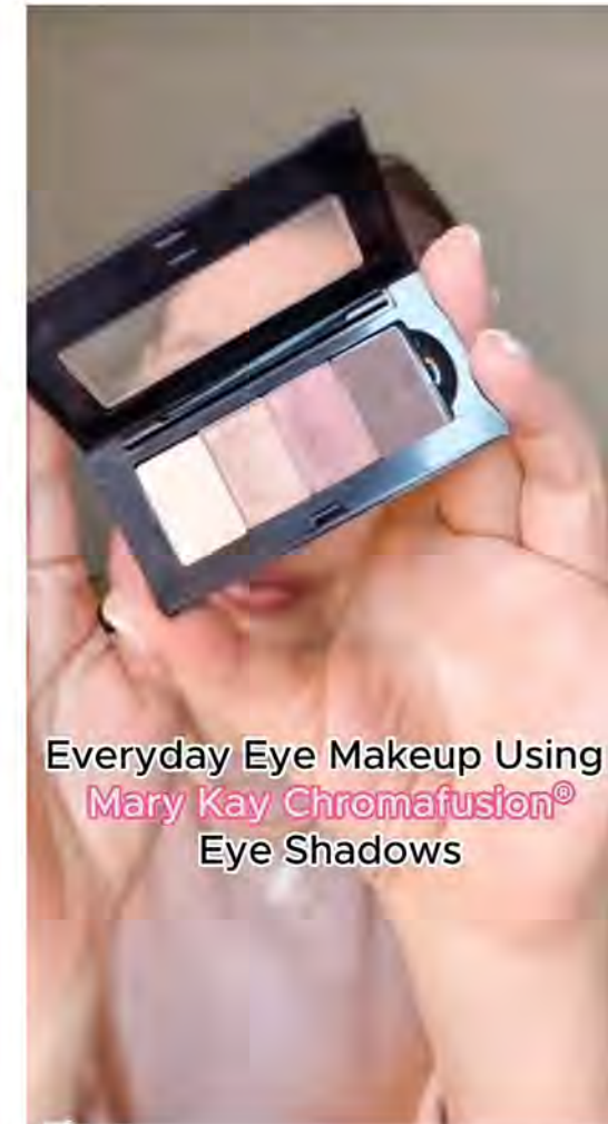
Everyday Eye Makeup Using Mary Kay Chromafusion® Eye Shadows

Capture a video of yourself zooming in on Mary Kay Chromafusion® Eye Shadow in your preferred shade in your Mary Kay Petite Palette® . Then apply the eye shadow on your eyelid using the Mary Kay® All-Over Eye Shadow Brush.