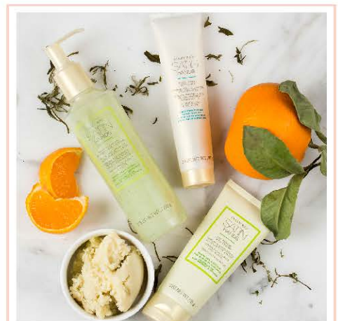
Satin Hands Pampering Set, 38