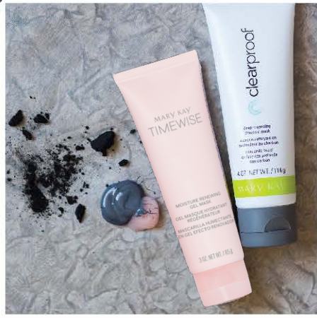
Multimasking Set, $49