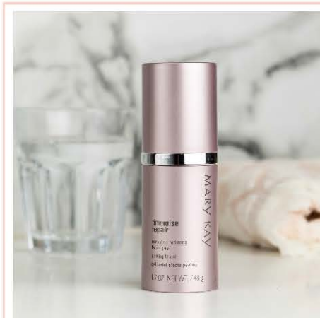
Revealing Radiance Facial Peel, $68