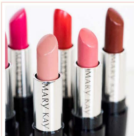
Lipstick or Lipgloss, $20ea