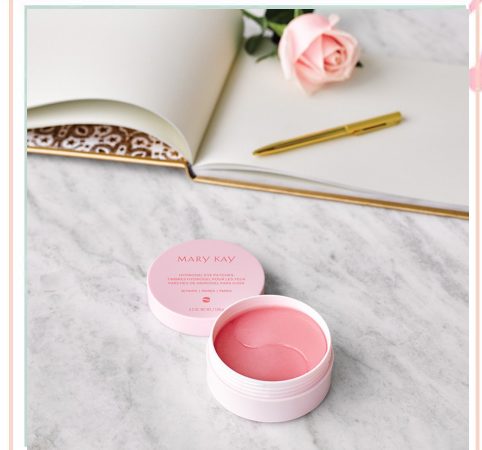
Hydrogel Eye Patches, $40