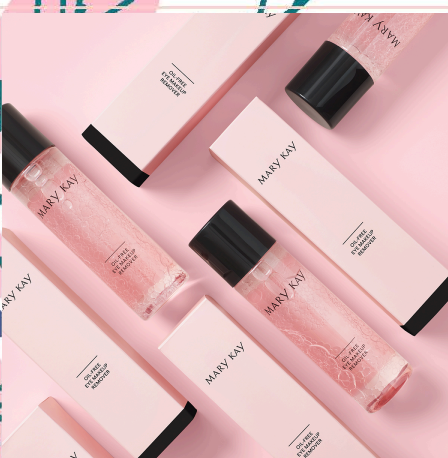
Oil-Free Eye Makeup Remover, $20