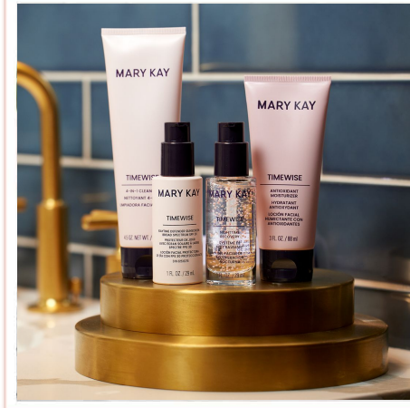
TimeWise Miracle Set, $116