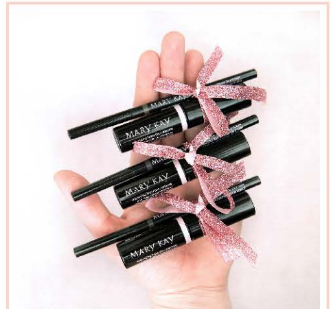
Lash Bundle, $28