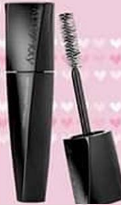
Lash Intensity Mascara