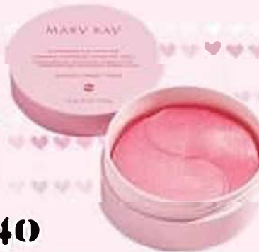
Hydrogel Eye Patches