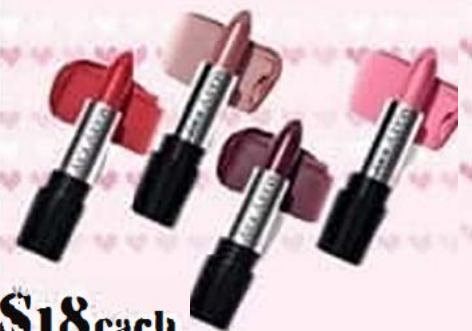
Gel Semi-Matte Lipstick