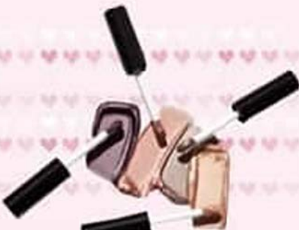
Liquid Eye Shadow