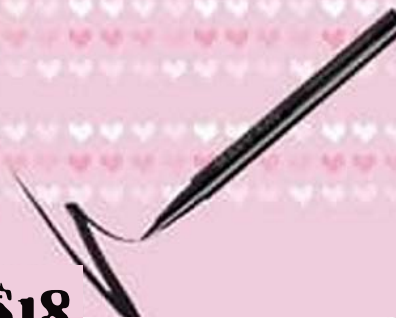
Waterproof Liquid Eyeliner Pen