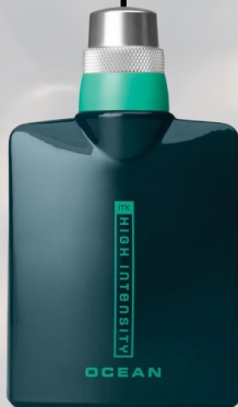
High Intensity Ocean Cologne $46