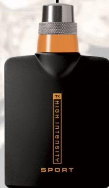
High Intensity Sport Cologne $46