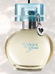
Thinking of You Eau de Parfum $36