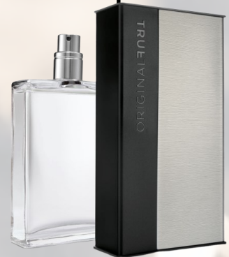
True Original Cologne $42