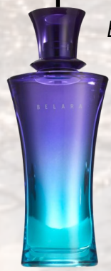
Belara Eau de Parfum $44