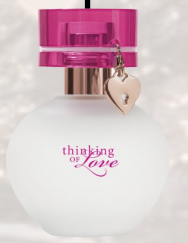
Thinking of Love Eau de Parfum $36