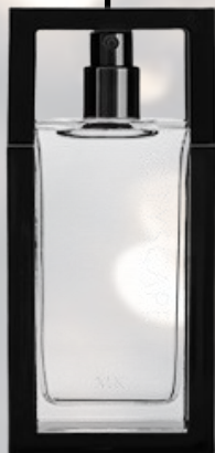
Cityscape Cologne $56