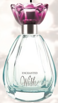
Enchanted Wish Eau de Toilette $40