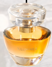
Illuminea Extrait de Parfum $80