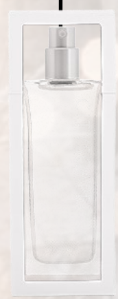
Cityscape Eau de Parfum $56