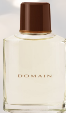
Domain Cologne $42