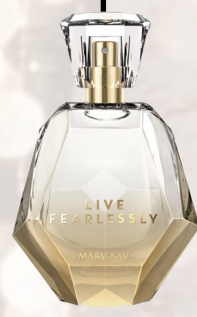
Live Fearlessly Eau de Parfum $48