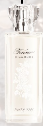
Forever Diamonds Eau de Parfum $46