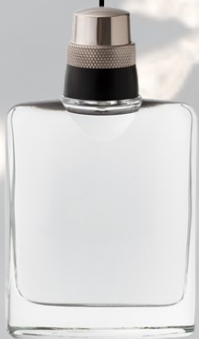
High Intensity Cologne $46