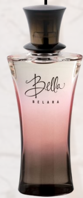
Bella Belara Eau de Parfum $44